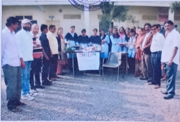
Maharashtra's spatial food dish 'Puran Poli' Stool