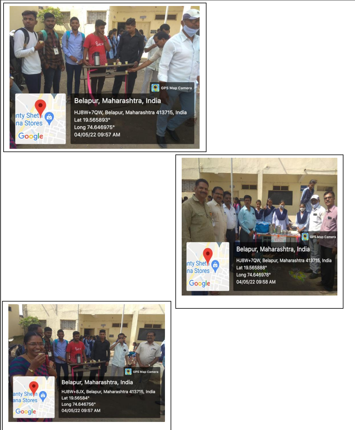
Food stalls and agriculture products Stalls In the Commerce festival ‘Anand Bazar’